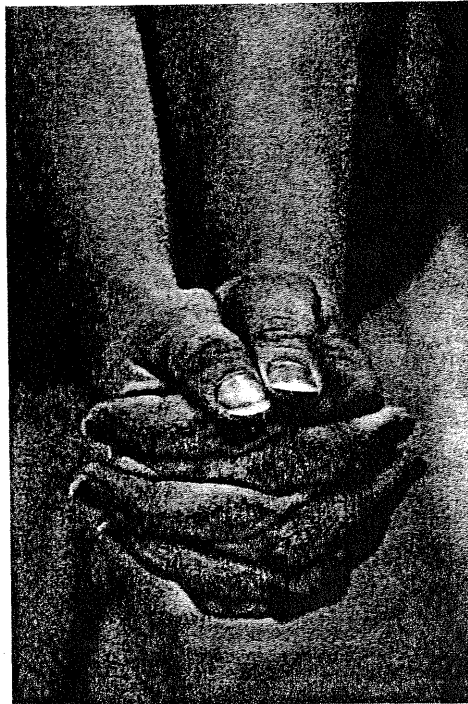
The interlocking grip