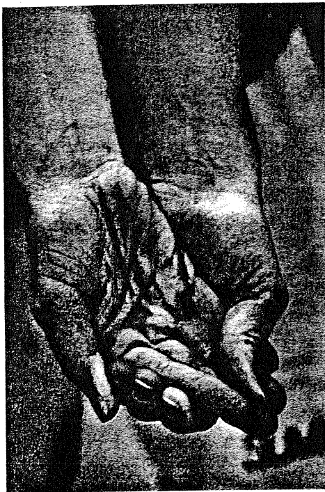
The scoop grip