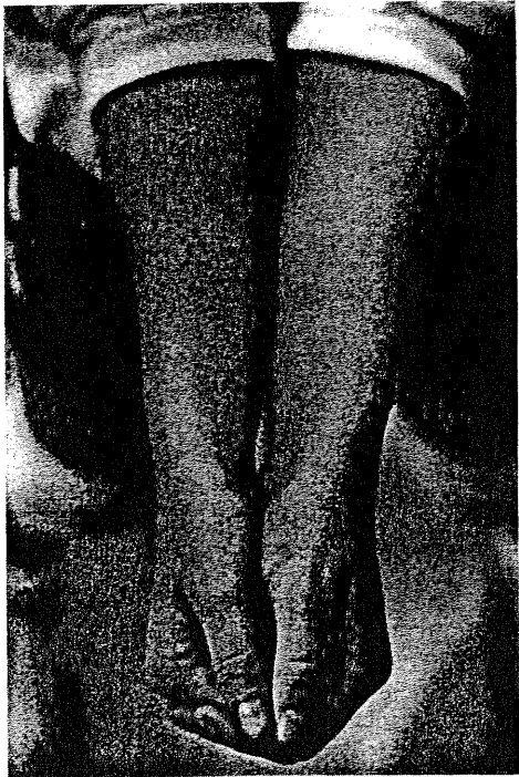
Form a platform with your forearms by bringing your elbows together