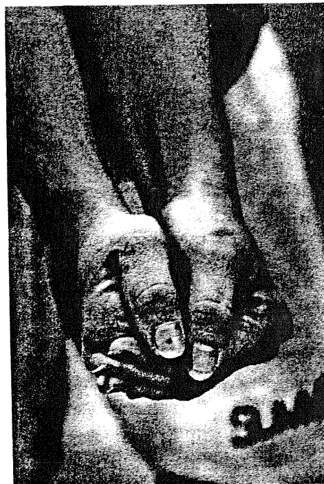
The fist grip